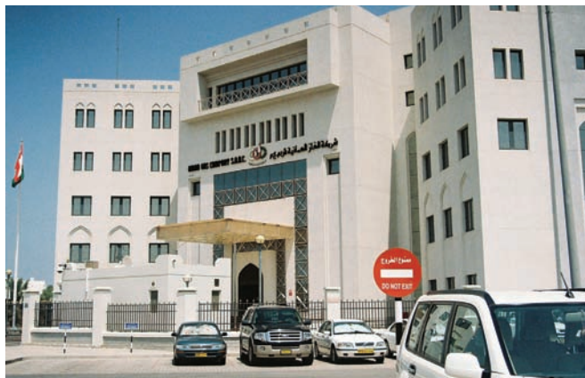
Oman Gas Company S.A.O.C. (OGC) is the major gas transportation company in Oman. It delivers natural gas for domestic, power and desalination, fertilizer, methanol, petrochemical, refinery, steel, and cement plants.

✓ In terms of installed base, differential-pressure (DP) flowmeters are widely used for a variety of measurements inside plants