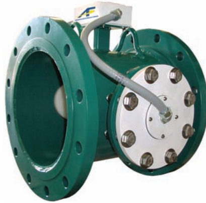
Figure 1. EMCO Flow Systems' Unimag magnetic flowmeter is an example of a pulsed AC measurement system.

DC magmeters were invented mainly as a solution to the zero-calibration issues associated with continuous AC magmeters. These magmeters operate based on a pulsed direct current. When the current is turned on, a voltage is generated, showing the velocity of the flowing liquid, plus any noise. When the current is turned off, any remaining voltage is assumed to be noise.