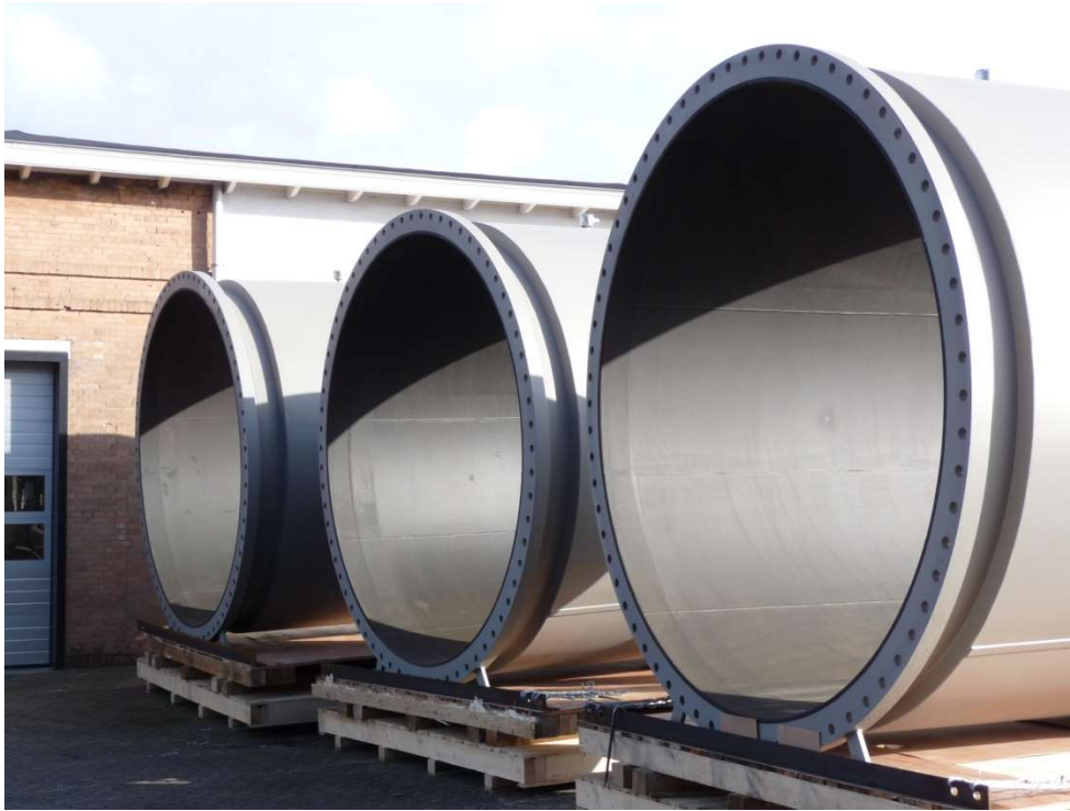
Three large diameter magnetic flowmeters await delivery.