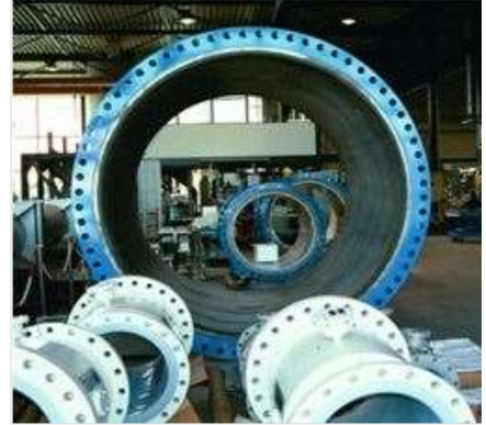
Magnetic flowmeters

Flow Research has published a new market study on the worldwide magnetic flowmeter market called The World Market for Magnetic Flowmeters, 8 th Edition . The study will determine the size of the worldwide market in 2025, forecasts the market through 2030, covers a variety of market segments, and provides market shares of the major suppliers.