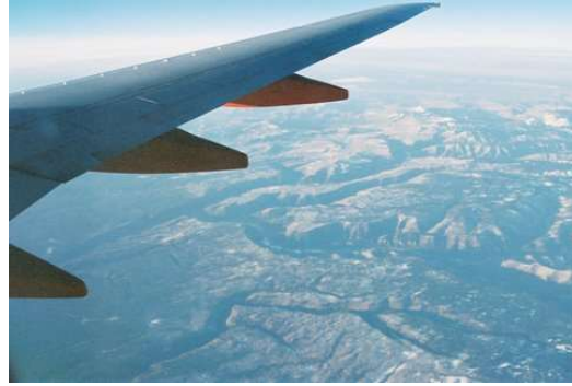
The view from 20,000 feet

We believe the better information, the better the decision – and Flow Research has always been a source of reliable, accurate data that companies can trust. This study will quickly bring you up-to-speed on the global flowmeter market and its many components.