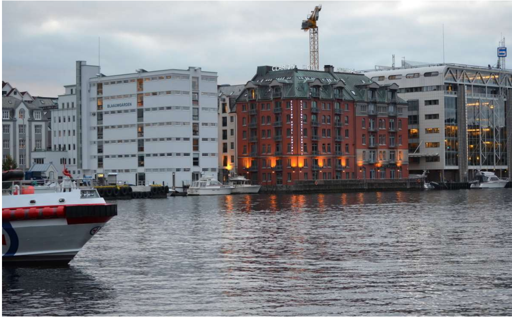
Bergen, Norway