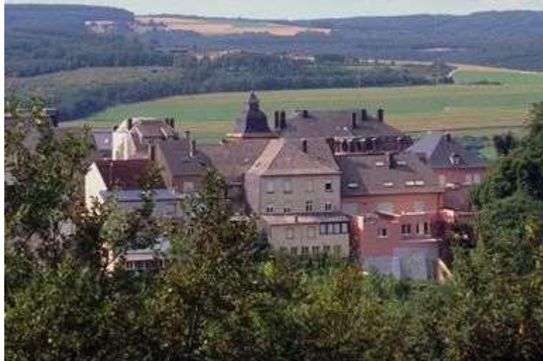
Points of view: A view of houses from the top

Generally speaking, the more senses we perceive an object through, the more knowledge we have of it. Anyone who has tried watching television with the sound turned down can appreciate this statement. Food is another good example. Our appreciation of food is greatly enhanced